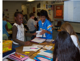
OMMN provides opportunities for students to experience success in a wide range of activities, both individually and in a team environment.

excel in school. Co-curricular activities provide a range of opportunities for students to try new experiences and gain the confidence that comes from taking risks and finding success in a variety of environments. This relies upon the understanding that every member of Old Mill Middle North is expected to contribute to a genuine sense of community. We achieve this by expecting that each and every student and staff member appreciates and embodies virtues such as respect, compassion, courtesy, integrity, kindness and perseverance.